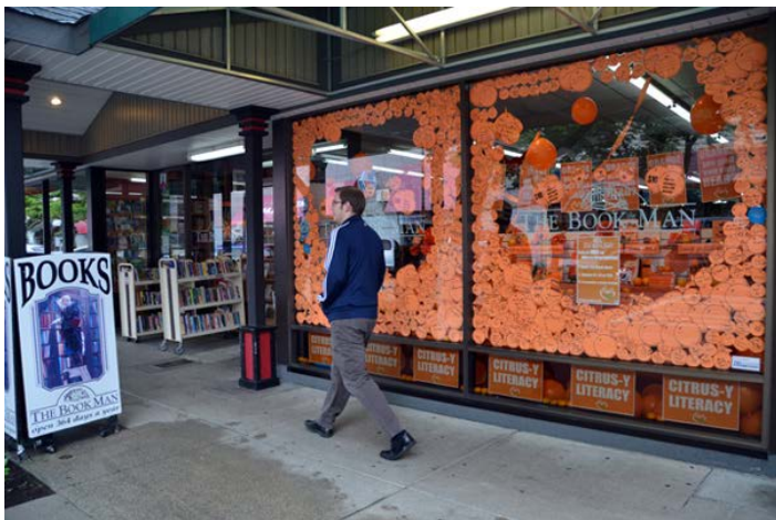
A downtown shopper strolls past the Book Man's Citrus-y Literacy window display.